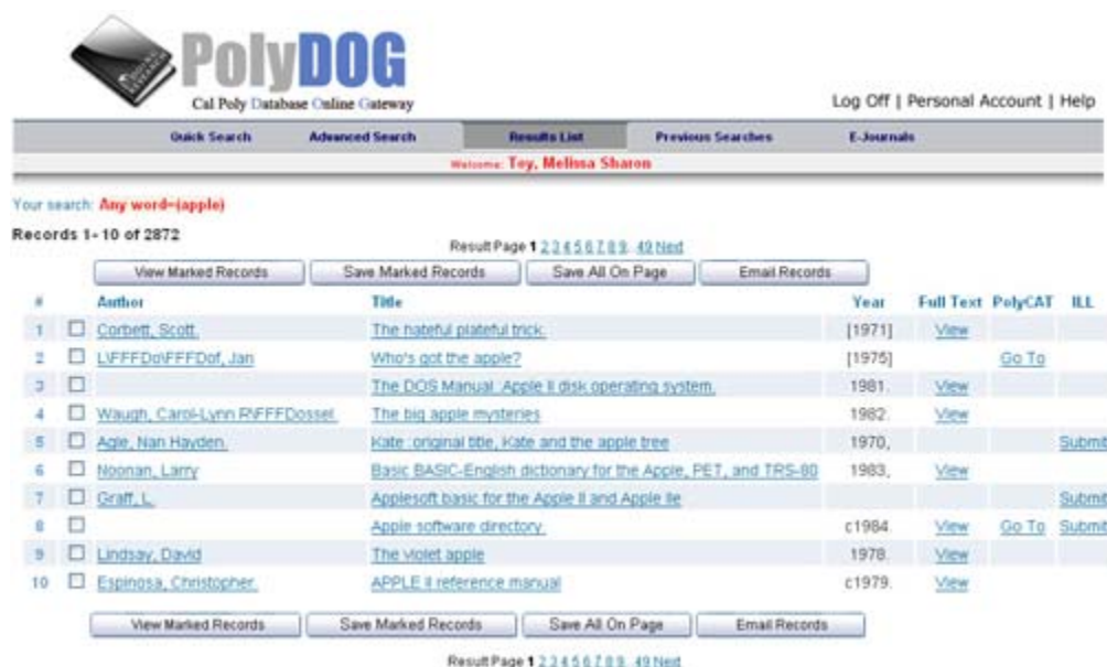
Figure 3: Redesigned Metalib Results Page

Throughout the quarter, the student team met with the librarians and presented their designs and suggestions. Their overall results were submitted to the library in the form of a final project report. This work was found to be so productive and useful, that the library carried on and presented the recommendations to the product vendor, who has subsequently incorporated many of them into a new release of their commercial product.