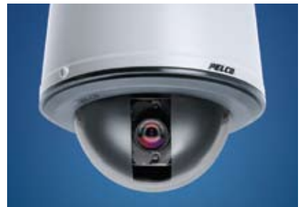
Spectra IV Camera Positioning System

Designed and built for continuous duty, Esprit offers the most dynamic movement capabilities available, along with load-bearing and wind resistant capabilities that allow it to remain completely operational in 90 mile-per-hour wind conditions. Esprit can accelerate and decelerate more quickly, more responsively and more accurately than any other pan-and-tilt system.