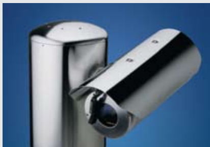
ExSite for Explosionproof Security

The Pelco ExSite family is an explosionproof PTZ system that has been designed for maximum performance in the most demanding, hazardous-location video security applications. Designed to protect the world's critical infrastructures, every system is an easy-to-install, pre-tested and pre-configured package, making it the first complete, plug-and-play system designed for extreme applications.