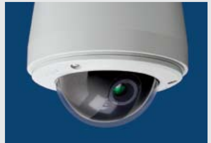
Choose from a Variety of Models and Lens Options