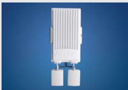
Endura Wireless Encoder/Transmitter

Wireless – The Endura Wireless series of encoders and transmitters sets the standard for wireless video security applications, providing high-quality digital streams and instant diagnostics. Specifically designed for video applications, wireless capabilities offer Point-to-Point, Multipoint and Backhaul options.