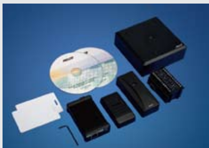
Ideal for Installations up to 32 Doors