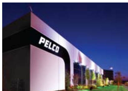
Seeing is Believing