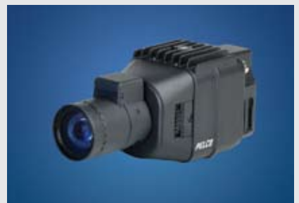
IP3701 Network Camera