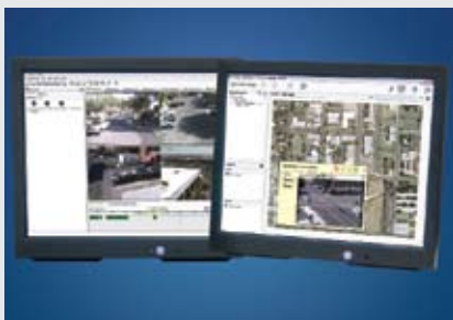
Endura Mapping Interface

Most importantly, Endura is a fully integrated, comprehensive system in which all components deliver the quality and performance you demand.