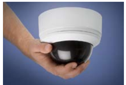
Small Form Factor Spectra Mini