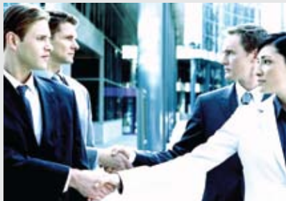
Partnering for Success