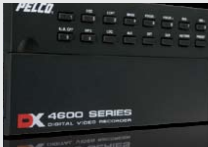
DX4600 Series DVR

Affordable and easy to use, these entry-level digital video recorders eliminate the need for the traditional VCR/multiplexer/matrix combination. Offering four-, eight- and sixteen-channel models with internal storage capacity of up to 3TB, these digital video recorders are designed to guard your business while protecting your bottom line.