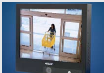
Pelco PublicView Monitor

Pelco PublicView Monitors are a strong deterrent to would-be thieves, letting them know that your premises are protected by video security – at the same time welcoming customers and displaying promotional messages. Created specifically for security applications, each Pelco PublicView Monitor integrates a high-brightness, high-contrast LCD and a Wide Dynamic Range camera with a varifocal lens suited for the challenging lighting conditions of entrances and lobbies.