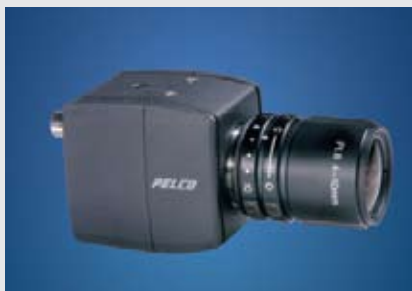
C10 Series Fixed Camera

Our broad selection of fixed cameras integrates the industry's leading camera technologies. Many of Pelco's fixed cameras include built-in Unshielded Twisted Pair (UTP) transmitters, integrated mount connections and unique camera set-up tools. Whatever the application, Pelco cameras are designed to make every installation a clear success.