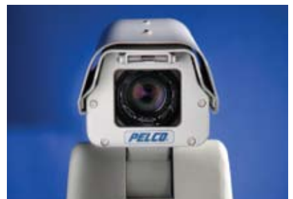
Esprit Integrated Positioning System