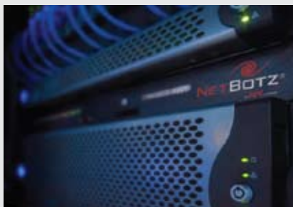
Pelco and APC Bundled Solutions for Asset Protection

Because Pelco is serious about the security of your security systems, we offer bundles that include the APC line of power conditioning technologies. The end result is a new sense of reliability and lower total cost of ownership through the mitigation of the most common causes of failure.