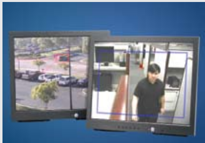
High-Quality Video Displays