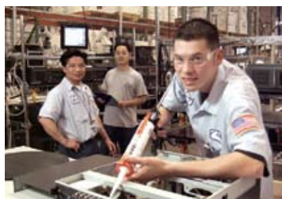
Unmatched Quality and Service