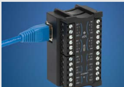
Intelli-M Access Control