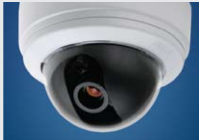
Camclosure IS Integrated Camera System

Integrating a camera, lens and enclosure into a discreet, compact package, the Camclosure IS Series brings together all the elements needed for a typical, fixed indoor or outdoor security installation. These attractive systems offer a variety of options with a whole host of features that make every Camclosure fast and easy to install. Weather and vandal resistant, they also provide that additional protection – and peace of mind – demanded by many of today’s installations.