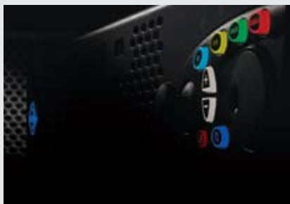
The Ultimate IP/Analog Recorder

Among the first to take advantage of PoE technology, Intelli-M's eIDC Ethernet-enabled integrated door controller plugs in to any existing Ethernet network using CAT 5e or CAT 6 cable. The result is the ability to run power and data on a single cable, eliminating the need for a local power supply. Coupled with its compact size, Intelli-M is the answer for more efficient and cost-effective installations with reduced capital expenditures.