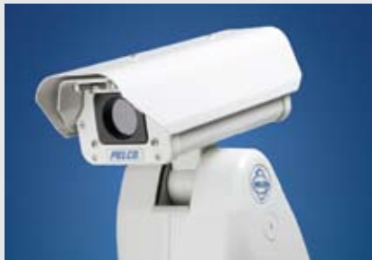
Esprit Thermal Imaging Camera System

And because it is obvious where the camera is pointing, it is a great deterrent for security applications.