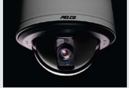
Spectra IV IP

IP3701 Series Color Network Cameras add value to existing IT and security investments. Similar to the Camclosure IP Series, IP3701 cameras can be viewed through a standard Web browser, Endura system or third-party software. Convenient Power over Ethernet makes IP3701 installation easy and cost effective. Extended Dynamic Range guarantees clear images in extreme lighting environments and the distinctive design is ideal for use in confined spaces.