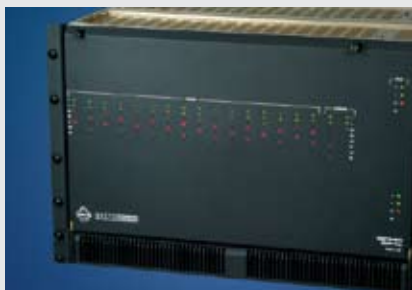
System 9770 Video Matrix

Pelco offers a complete array of viewing solutions designed for the stringent demands of the video security professional. Whatever your space, budget, style or technology needs, Pelco has a solution for your application. From CRTs and LCDs to Plasma and DLP technology, Pelco viewing solutions are compatible with the complete line of Pelco video security systems, using the latest technology to deliver the exceptional performance you expect from the industry leader.