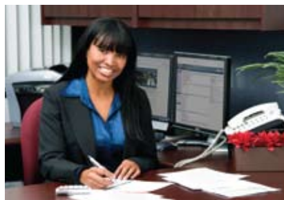
Fanatical Customer Service

Support – You're never on your own when you're with Pelco. Our network of Product Support professionals, Global Field Trainers, local Manufacturer's Sales Representatives and industry experts is available night and day to assist you in any way necessary.