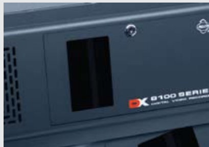
DX8100 Digital Video Recorder

Security professionals demand reliable performance, innovative functionality and easy operation from their digital video recorders. It is, therefore, easy to see why Pelco DX8100 systems are the choice for professional security. Since 2003 this family of DVRs has led the industry with exceptional image quality, immense storage capacity and server-to-server connectivity. Now Pelco is proud to announce the latest evolution of this powerful system, the DX8100 v.1.2 DVR.