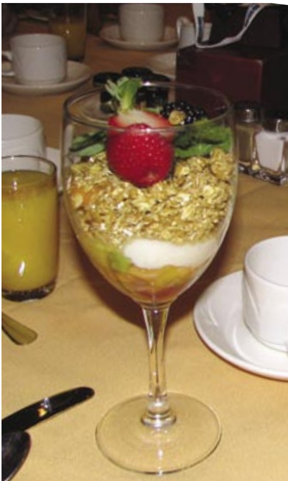
Exhibit Hall Grand Opening Reception